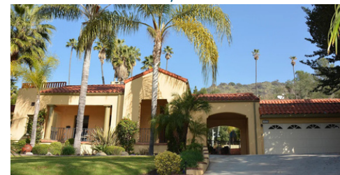
SOLD | $4,300,000 1039 W Mountain, Glendale