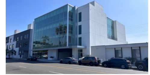
SOLD | $7,000,000 610 W Broadway, Glendale