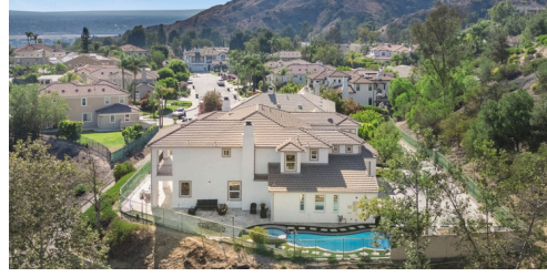
SOLD | $3,800,000 3318 Durham Ct, Burbank