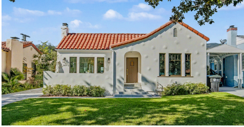
SOLD | 1,920,000 1317 Ethel St, Glendale