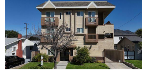
SOLD | $2,655,000 515 W Lexington Drive, Glendale