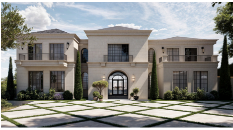
ACTIVE | $5,875,000 652 Robin Glen Dr, Glendale