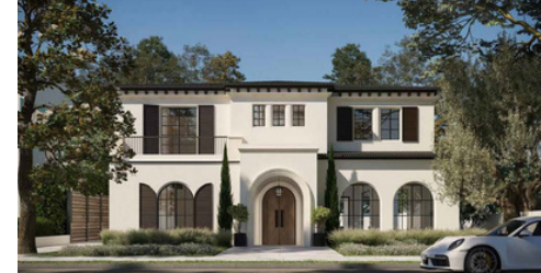
SOLD | $2,499,000 (RTI) 1514 Columbus Ave, Glendale