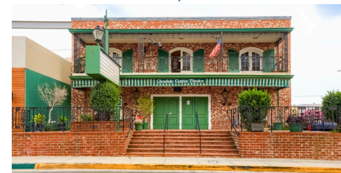
SOLD | $4,975,000 324 N Orange St, Glendale