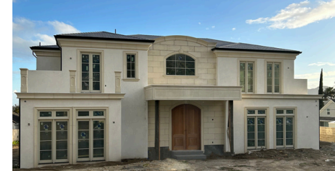
SOLD (private sale) | $4,435,000 722 W Kenneth Rd, Glendale