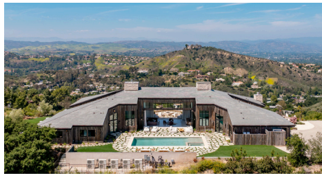
ACTIVE | $10,990,000 3121 Old Topanga, Calabasas