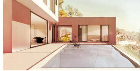
SOLD | $1,780,000 (RTI) 1651 Ridgeview Drive, Glendale