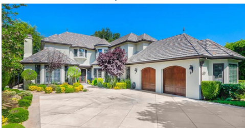
SOLD | $4,025,000 4358 Fairlawn Dr, La Canada