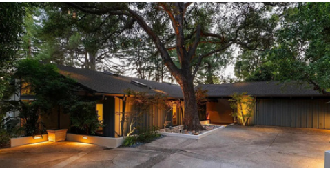
SOLD | $3,450,000 5045 Jarvis Ave, La Cañada