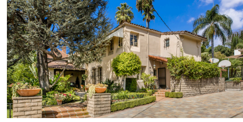
SOLD | $2,499,900 241 W. Kenneth Rd, Glendale