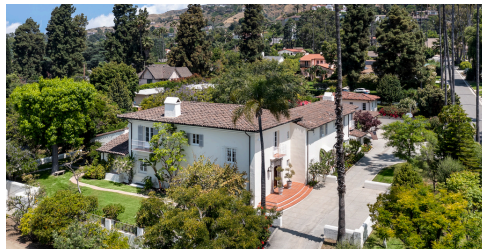
SOLD | $4,735,000 305 W Kenneth Rd, Glendale