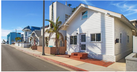
SOLD | $2,900,000 119 37th Street, Newport Beach