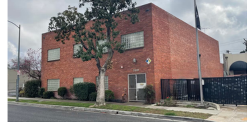
SOLD | $4,050,000 710 W Wilson Ave, Glendale