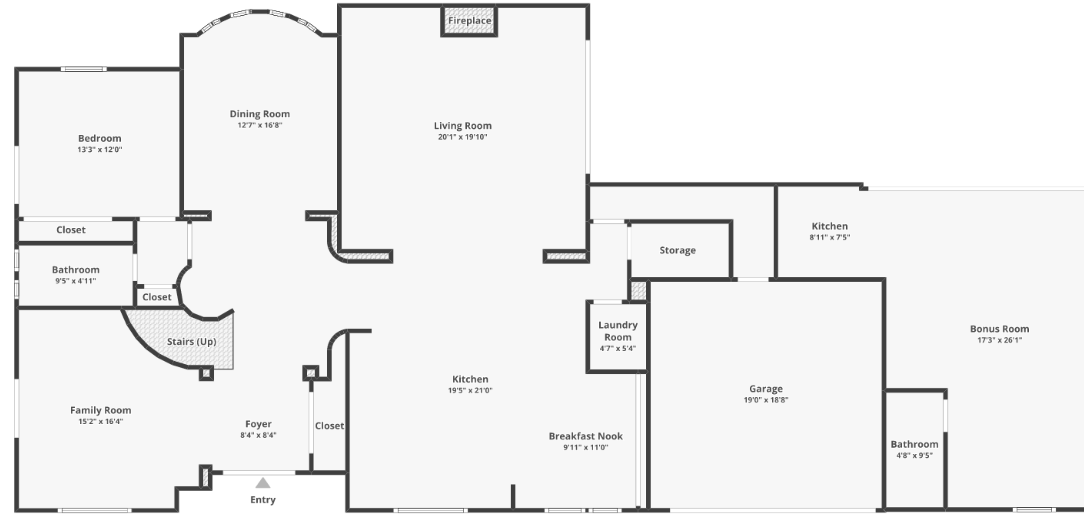
FLOOR 1 Finished area: ~2,377.93 sq. ft.