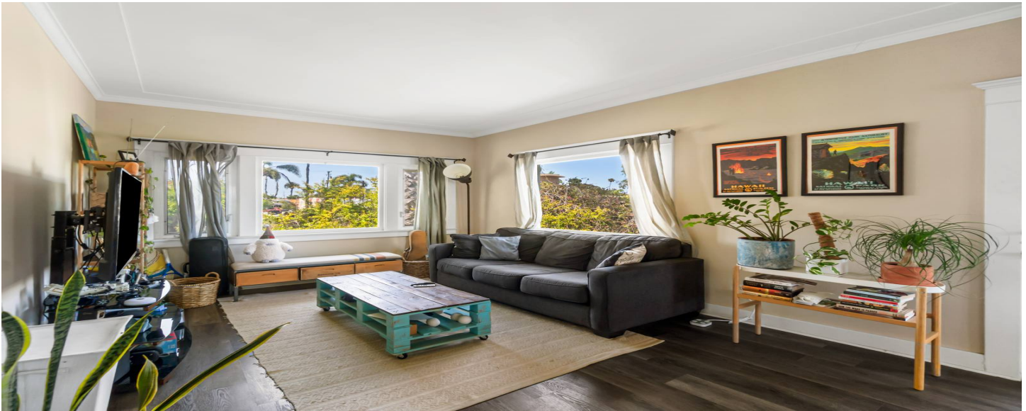
Spacious living room at 3366 E. 1st Street — crown molding, luxury vinyl flooring (2019), and large double-pane windows with treetop views.