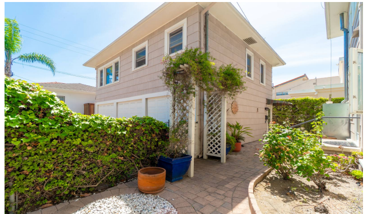
TOP LEFT: Main residence at 3366 E. 1st Street. TOP RIGHT: 29 Redondo Avenue street elevation. BOTTOM LEFT: Aerial view — property one block from Pacific Ocean. BOTTOM RIGHT: Close aerial showing corner lot at E. 1st Street and Redondo Avenue.