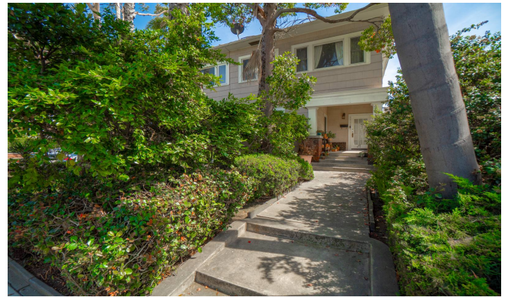
LEFT: Dining area at 3366 E. 1st Street with ocean glimpse through window. RIGHT: Front approach to 3366 E. 1st Street — lush mature landscaping and classic porch.