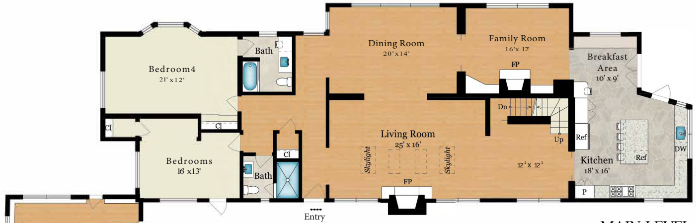
MAIN LEVEL 2,927 SQ Fr