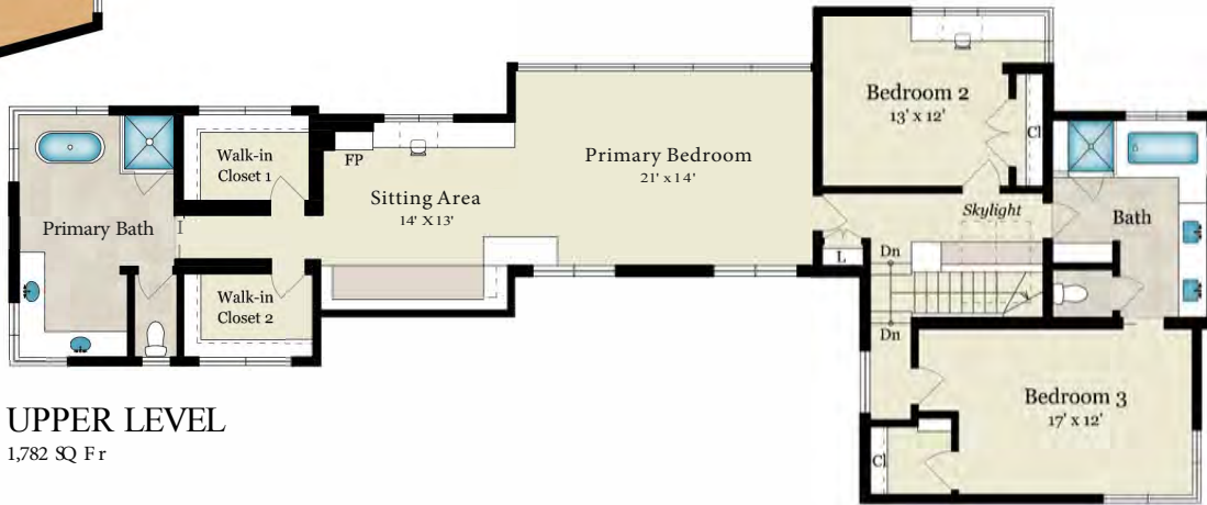
UPPER LEVEL 1,782 SQ Fr