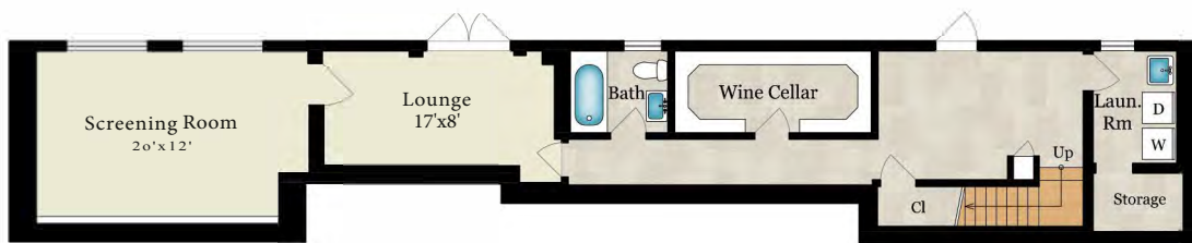
LOWER LEVEL 1,092 SQ Fr