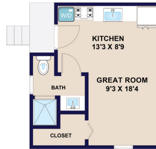
OUTDOOR GUEST UNIT