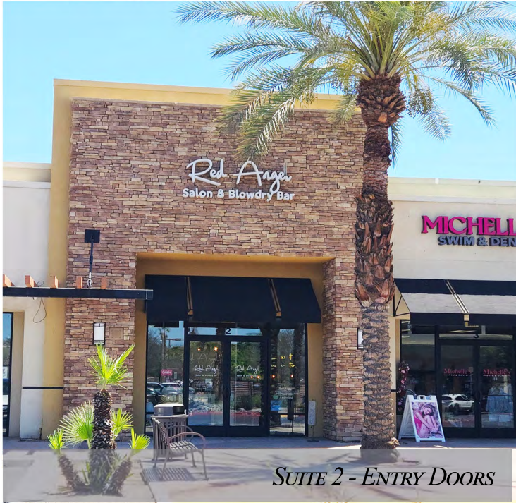
SUITE 2 - ENTRY DOORS