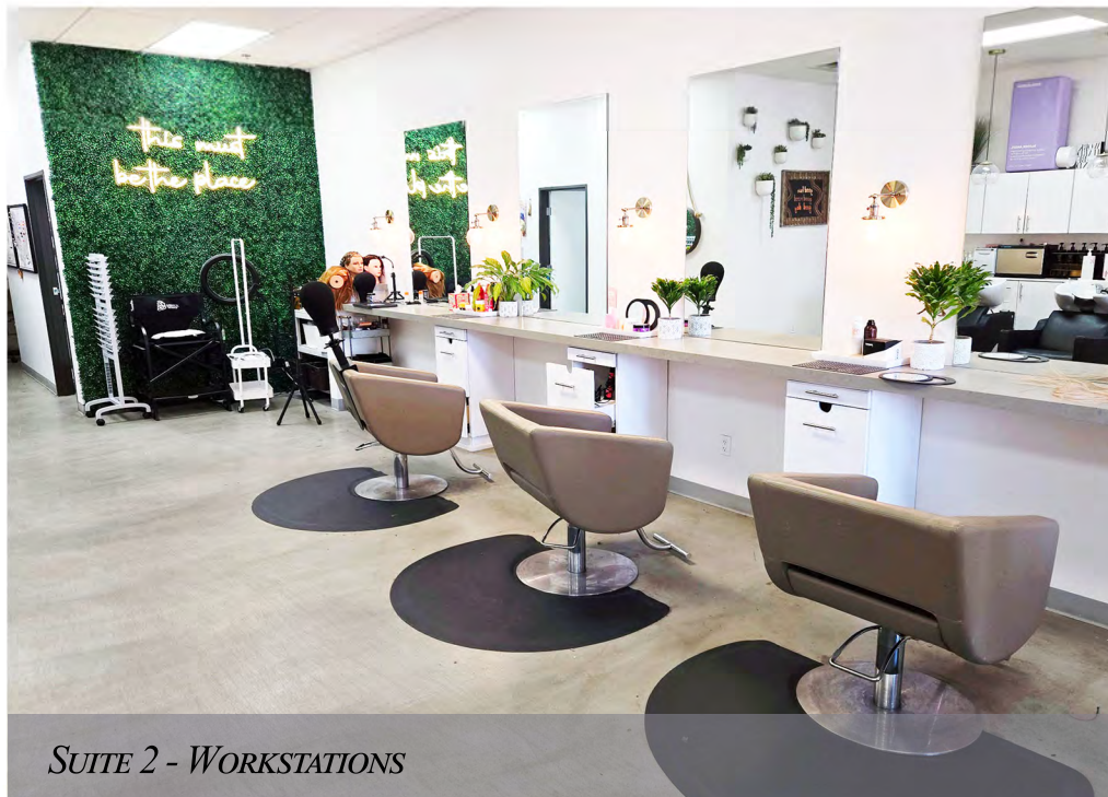
SUITE 2 - WORKSTATIONS