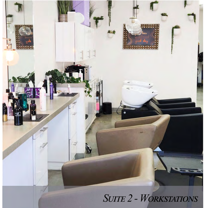
SUITE 2 - WORKSTATIONS