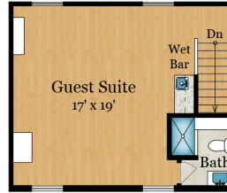
GUEST HOUSE ABOVE DETACHED GARAGE 510 SQ FT