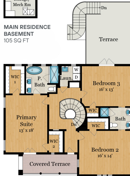
MAIN RESIDENCE UPPER LEVEL 1,255 SQ FT