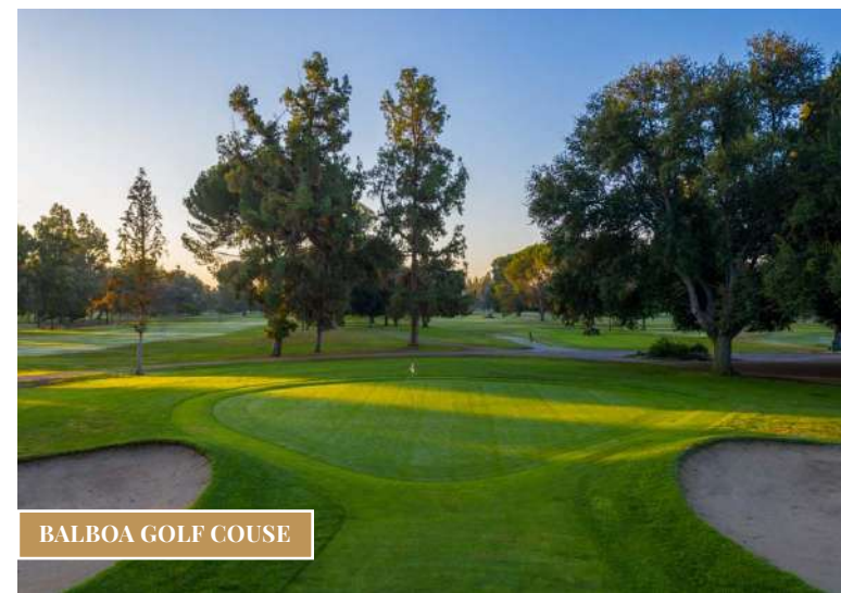
BALBOA GOLF COURSE