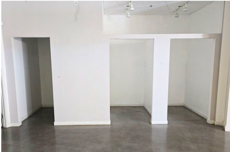
SUITE 4 - FORMER DRESSING ROOMS