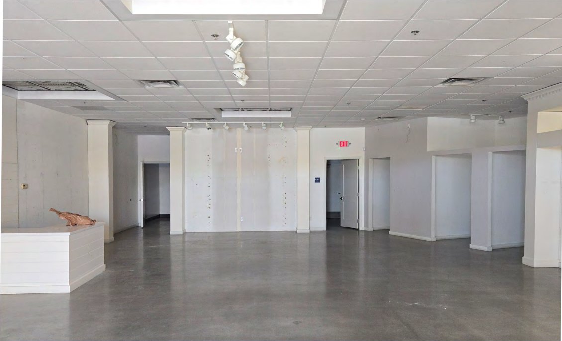
SUITE 4 - SALES FLOOR AREA