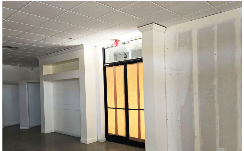
SUITE 4 - ENTRY VIEW