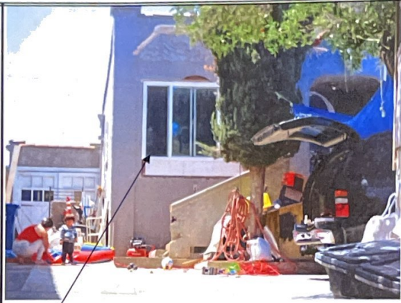
Window change out