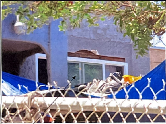
Window change out