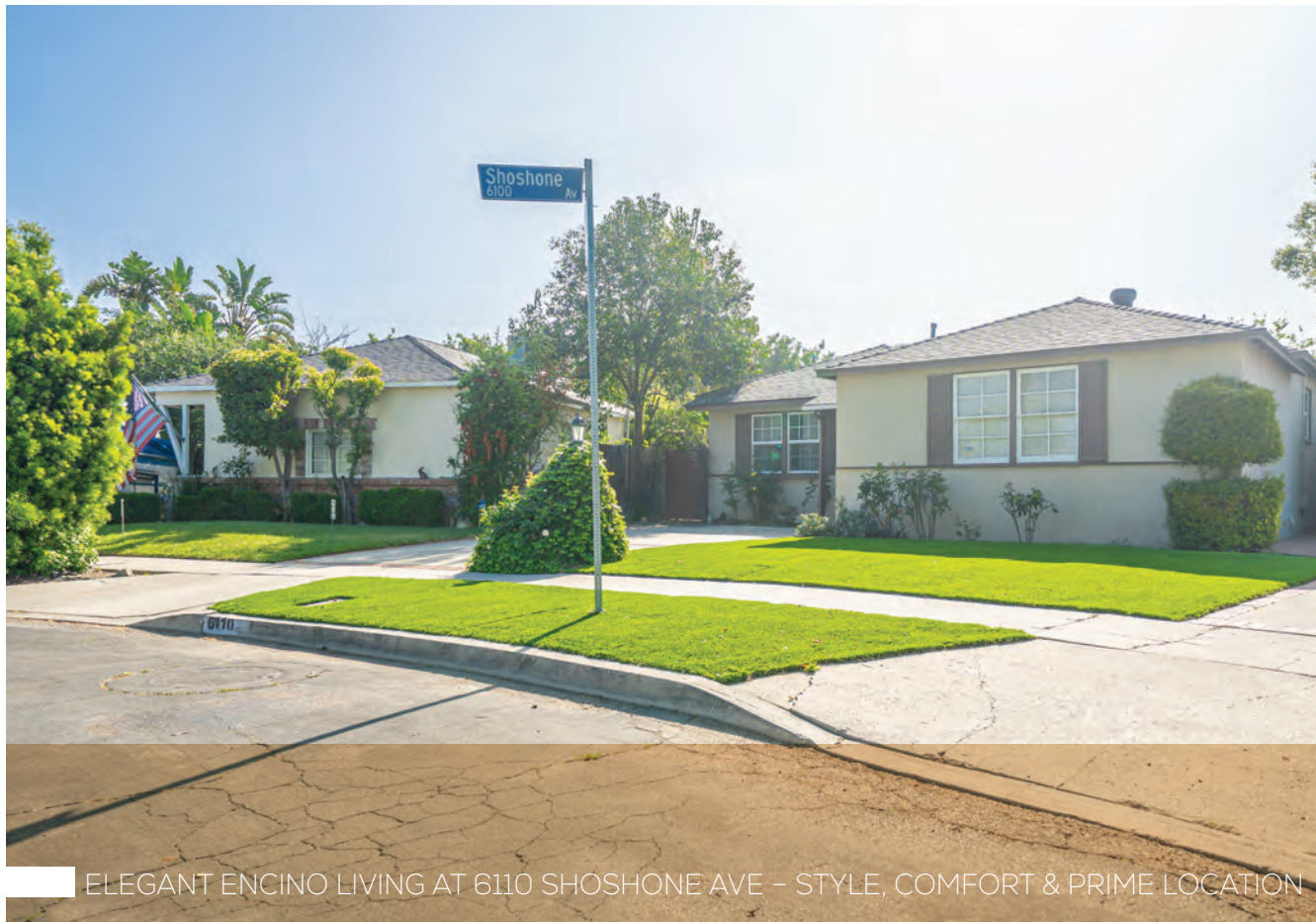
ELEGANT ENCINO LIVING AT 6110 SHOSHONE AVE - STYLE, COMFORT & PRIME LOCATION