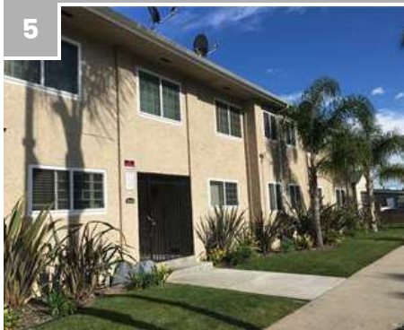
5 8500 S BYRD AVE Inglewood, CA 90305

Price: $2,475,000 Bldg Size: 8,669 SF No. Units: 9 Cap Rate: 4.79% Year Built: 1951