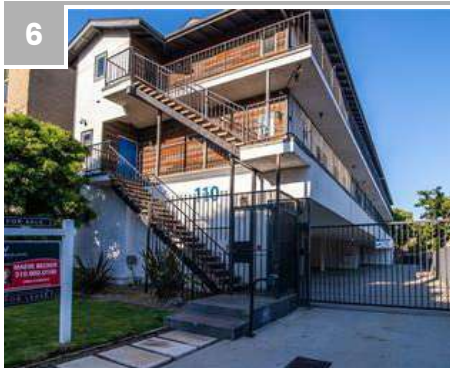
6 110 S EUCALYPTUS AVE Inglewood, CA 90301

Price: $2,545,000 Bldg Size: 7,280 SF No. Units: 7 Cap Rate: 6.17% Year Built: 1987