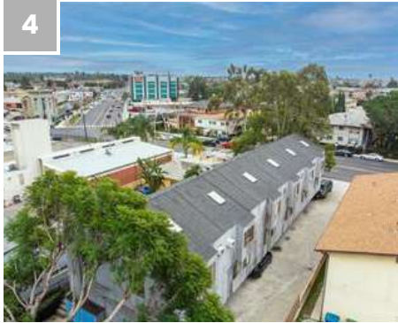
4 824 CENTINELA AVE Inglewood, CA 90302

Price: $1,700,000 Bldg Size: 7,194 SF No. Units: 6 Cap Rate: 5.35% Year Built: 1989