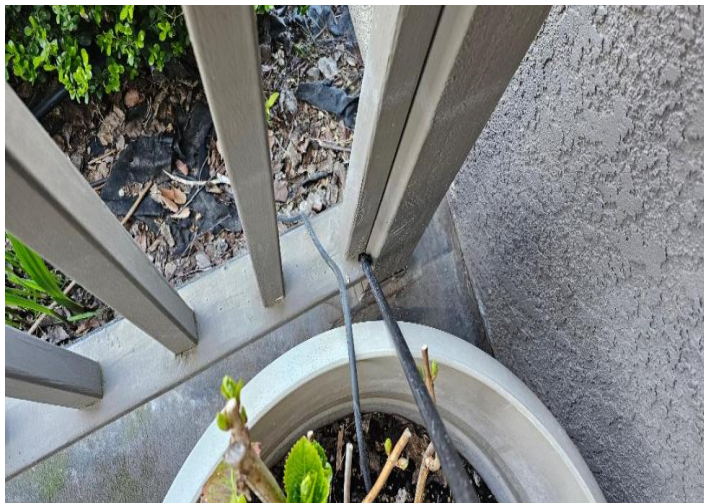
3C - Damaged handrail members.