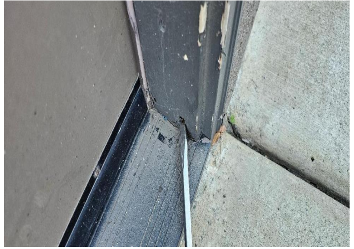
3A - Damaged side garage door jamb.