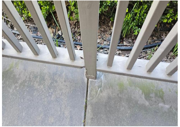
3C - Damaged handrail members.