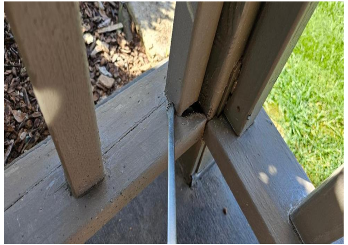
3C - Damaged handrail members.