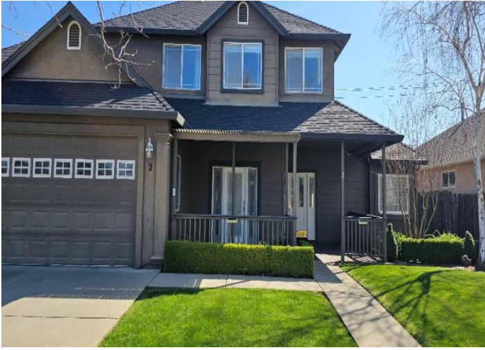
Front of the structure.