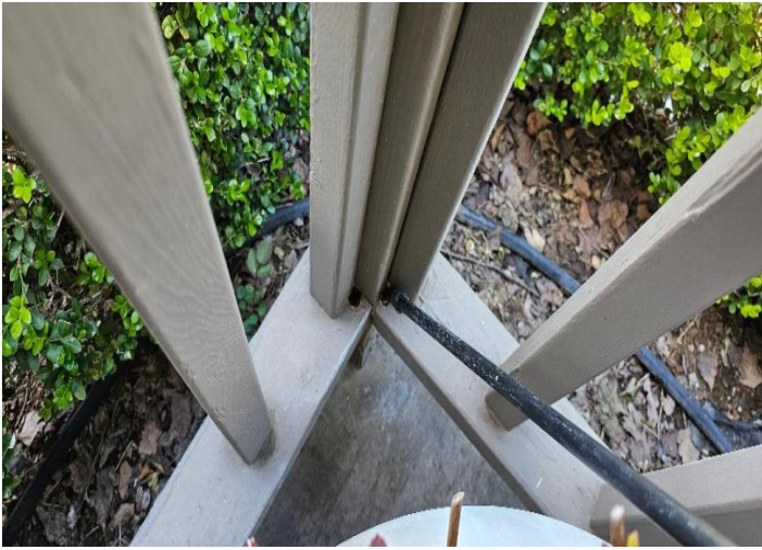
3C - Damaged handrail members.