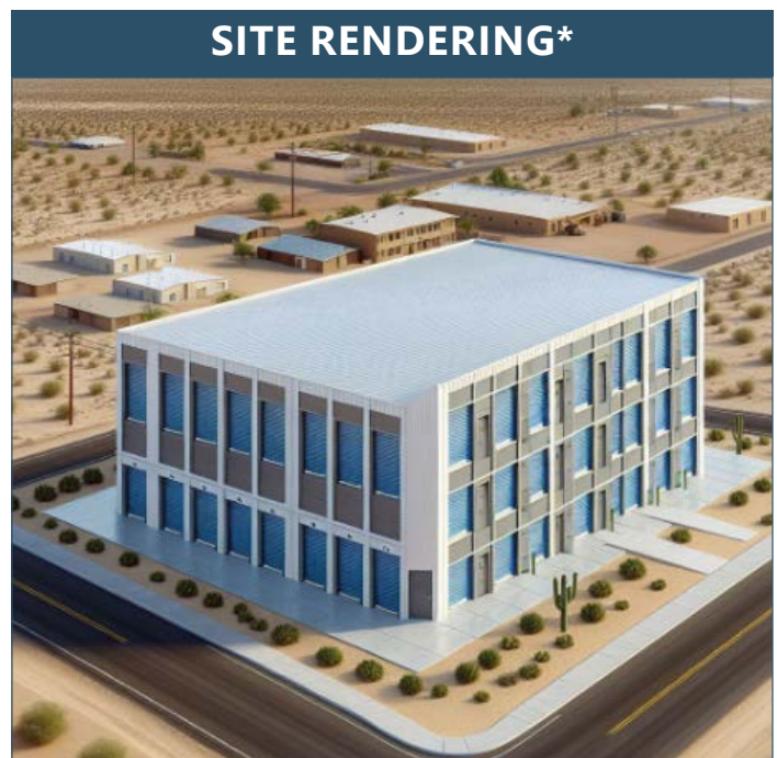
*Rendering includes adjacent parcel. Adjacent parcel also available for sale.

760.360.8200 | DesertPacificProperties.com | 77-933 Las Montanas Rd. Suite 101 Palm Desert CA 92211